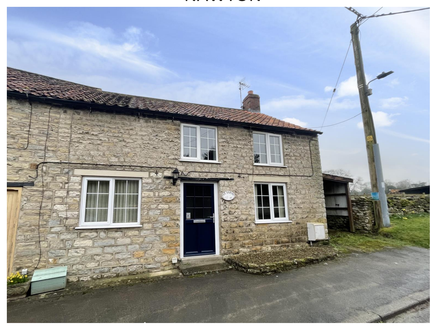
Classic country cottage with a good range of accommodation quietly located within Nawton village.

1,227 square feet of accommodation in need of some gentle updating: Entrance Hall – Sitting Room – Living Room - Dining Kitchen – Utility – Cloakroom Up to two Bedrooms – House Bathroom Courtyard area and private lawned garden with an attractive open view – Stone barn/workshop. NO ONWARD CHAIN