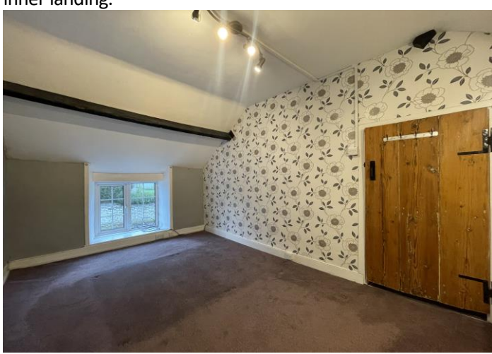
BEDROOM TWO 3.64 m (11'11"0 x 2.55 m (8'4") Casement window to the front. Radiator

Casement window to the front. Radiator. Through to the inner landing.